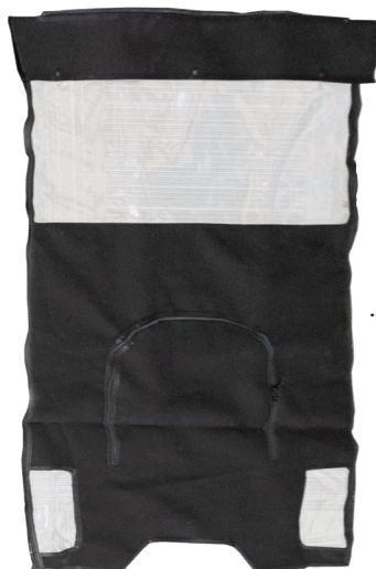
REAR ENCLOSURE PANEL