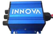
Mini Amp w/ built in bluetooth

Phillips Screw Driver Wire Stripper Crimp Tool